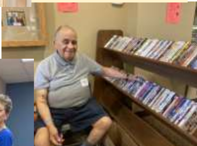
Hard working volunteers