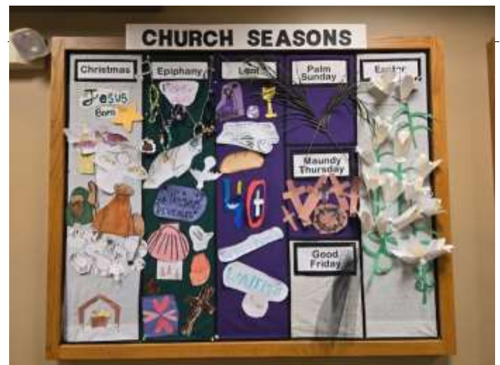
Done by grades, 2, 3 and 4, as a learning experience